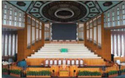
Iglesia ni Cristo (IV/50) Philippines New Organ (2014)