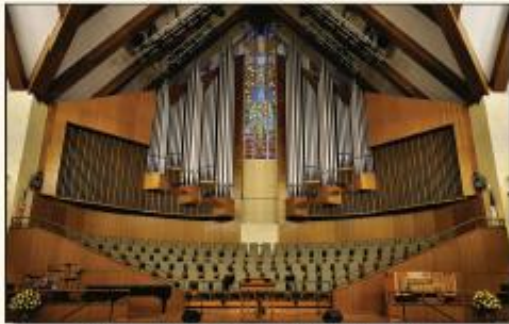
Tallowood Baptist (IV/93) Houston, TX Re-engineer and Complete Organ (2013)